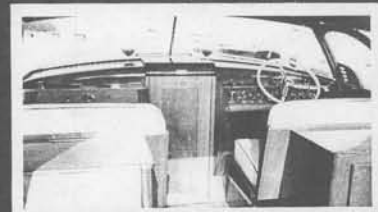
Each Shepherd is a custom built boat for smooth, comfortable riding and long, rugged service.