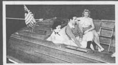
Engines in the stern afford maximum running efficiency and quiet performance at all speeds.