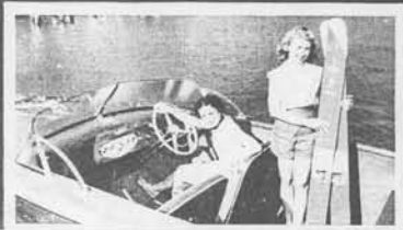
Operating controls are close to hand and the mold-curved windshield permits wide, uninterrupted vision.