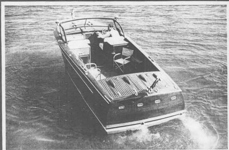
The 27' Graceful design, power, safety and comfort make Shepherd boats the finest boats on the water. Experienced boatmen built them; men who know boats buy them.