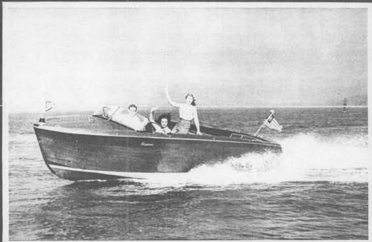
The 22' Shepherd boats are the result of unceasing research in marine engineering and architecture to build in one boat all the refinements which would give boatmen the perfection of quality craftsmanship.