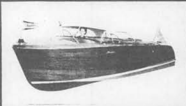
Sudden weather changes or relief from hot sun riding makes a convertible top a practical utility for your Runabout.