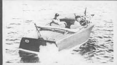
Long-seasoned, carefully selected wood is expertly fashioned and highly finished for this smartly turned-out Runabout.