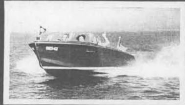
Line for line there is no more graceful design than is found in Shepherd boats.